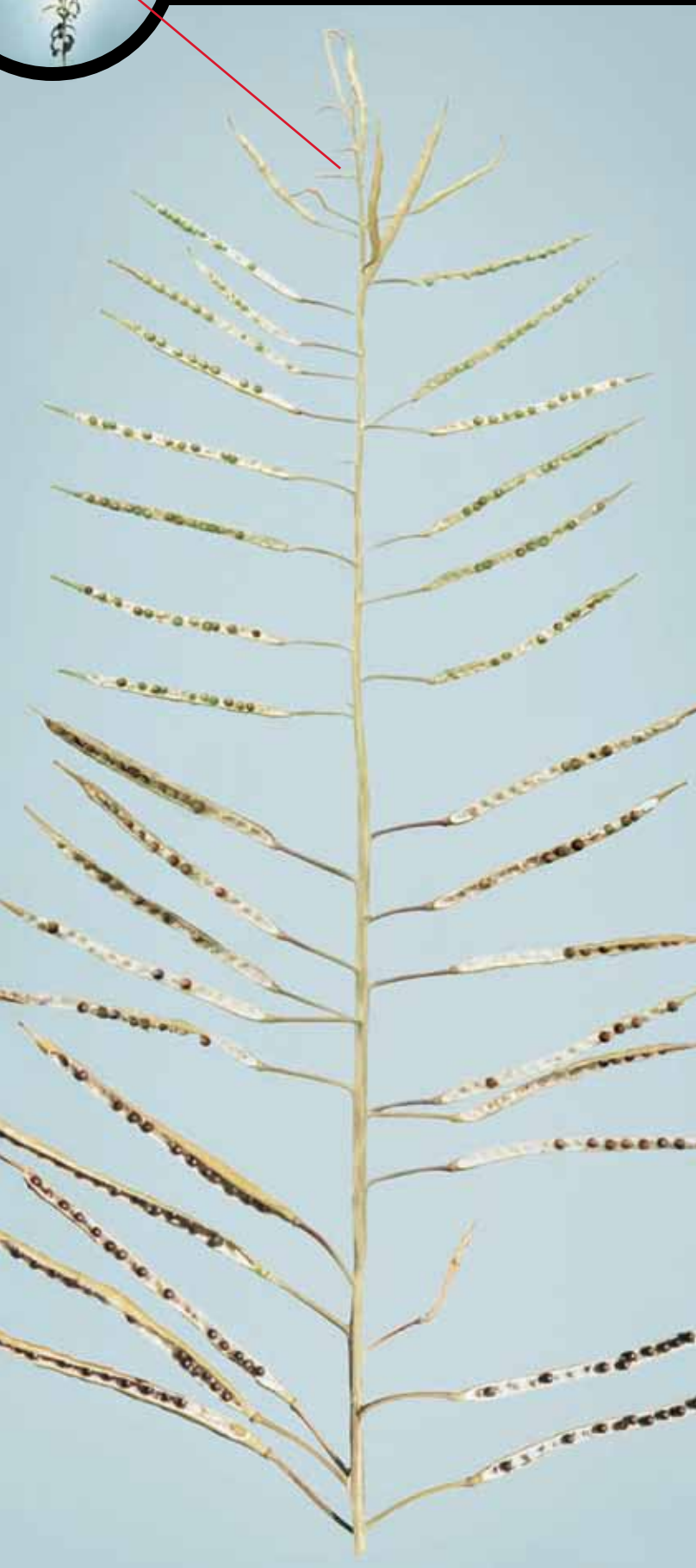
Illustration for determining seed colour change

The seeds in the pods near the top of the plant will look like this.